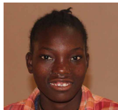
Anetty Reunited with Uncle