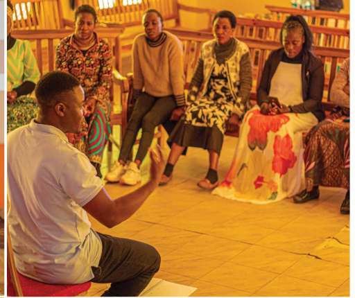
Chantry making a presentation during the training.