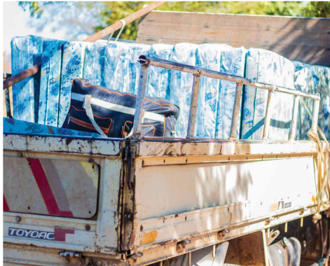
Mattresses & other items of the 13 children being delivered to their new homes.