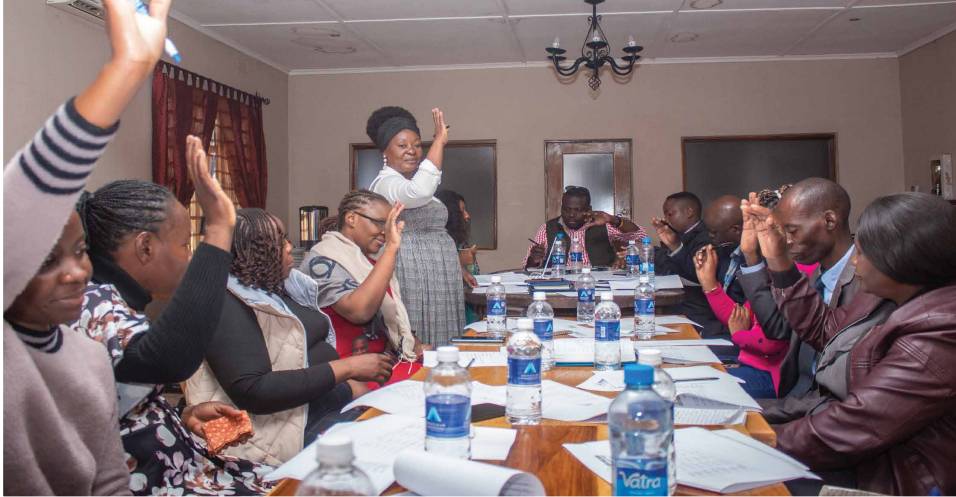
Given the facts presented, CMRC conduct a vote on whether or not to reintegrate a child

The ECCT recently held its first District CMRC meeting, chaired by the government's Department of Social Welfare. In the meeting, the committee reviewed the cases of 13 children and their families. After deliberations, the committee voted to discharge these children from the facility and identified alternative care options such as kinship, adoption, foster care, or independent living for each child. The committee also recommended ongoing support for the children and their families.