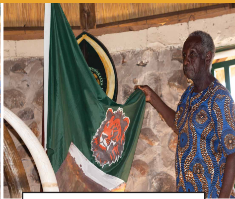
DEPUTY PRIME MINISTER