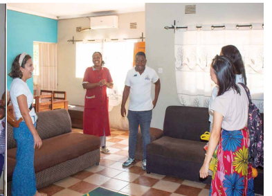
The Executive Director and ECCT Social Worker give our Australian Visitors a tour of the Facility