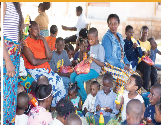
LUNCH TIME AFTER THE TOUR

This tour aimed to expose the children to our cultural backgrounds and... It was an amazing experience.