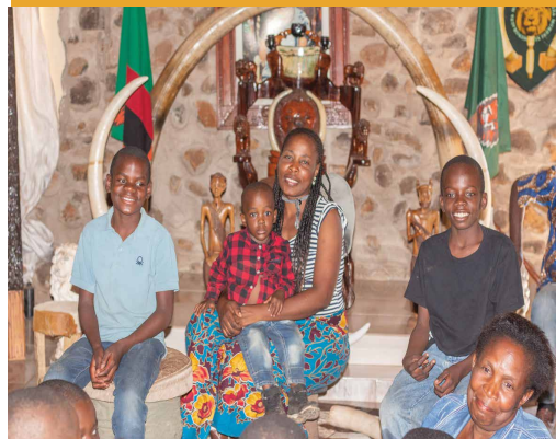
PHOTO NEAR THE CHIEF'S THRONE