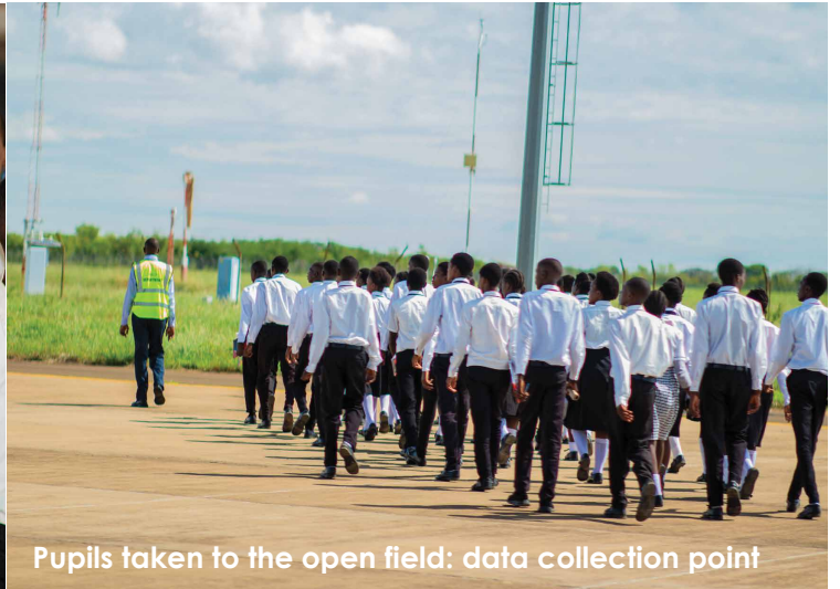
Pupils taken to the open field: data collection point

METEOROLOGIST SHOWING THE PUPILS HOW THE ANEMOMETER WORKS