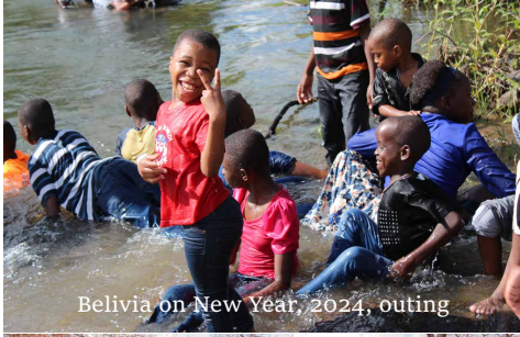
Belivia on New Year, 2024, outing