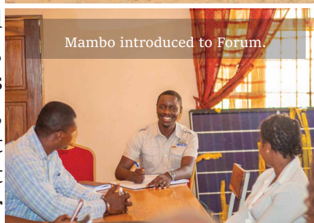
Mambo introduced to Forum.